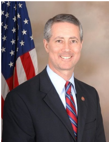
Congressman Mac Thornberry's office